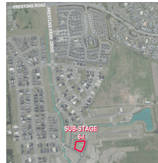
LOCATION PLAN 1:5000

AERIAL IMAGERY FROM LINZ DATA SERVICE BY A CREATIVE COMMONS LICENCE FLOWN 2018-2019