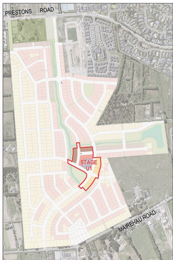
LOCATION PLAN 1:5000