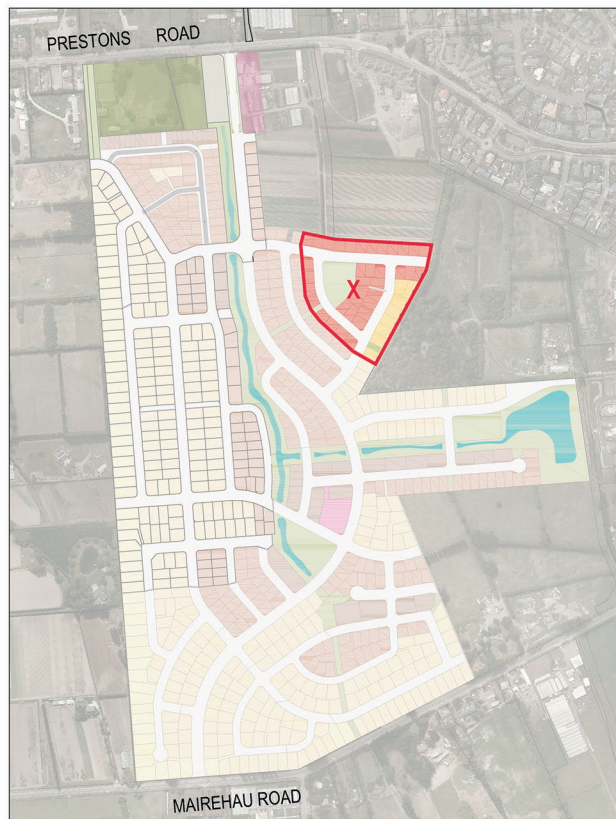
LOCATION PLAN 1:5000