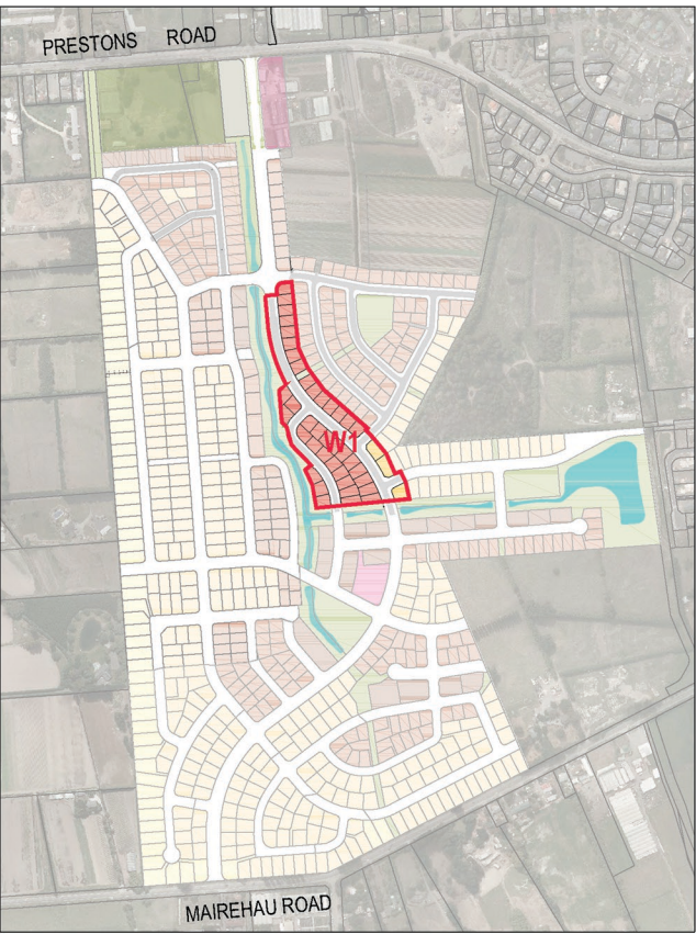
LOCATION PLAN 1:5000